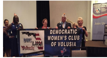
Club Banner Parade, 2016 DWCF Convention